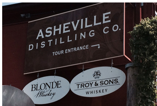
Troy and Sons Whiskey and Blonda Whiskey is produced at the Asheville Distilling Company in Asheville NC.

While this level of exuberant growth has its challenges, the region continues to benefit from the growth of the industry and identify opportunities within this growth. The fissures in the supply chain have begun to be identified and addressed as efficiently as possible. While our region's Community Colleges have enthusiastically developed curriculums to meet the craft beverage industry through manufacturing, hospitality, and raw product supplier needs, it is clear that there are still weak links in the chain. In January of 2015, Land of Sky hosted a Craft Beverage Summit with the emphasis on identifying industry strengths, weaknesses, challenges and opportunities. Over twenty-five industry representatives participated. The Summit results are below and revealed some cross-sector challenges and opportunities. The opportunities and challenges that cross all industries are highlighted. From this list, strategies were developed to address needs and expedite the implementation of industry opportunities.