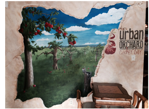
Urban Orchard Cider Bar is located in West Asheville.