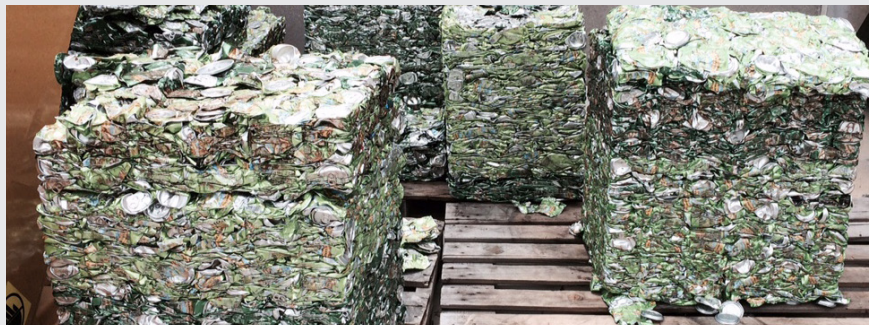
Recycling center at Sierra Nevada in Mills River.