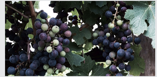
Grapes from Addison Farms Vineyard in Madison County, NC.

Challenge – Wastewater Managing BODs (Biochemical Oxygen Demand) and CODs (Chemical Oxygen Demand) is important to treatment. While not toxic, high concentrations