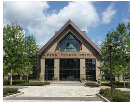
Sierra Nevada Brewing in Mills River opened its brewery taproom and restaurant in March 2015.

In WNC, industry growth was kick-started in 1994, by Highland Brewing Co. when they opened their doors as the first legal brewery in WNC since the 1920 Prohibition. The following 20 years brought many more breweries and became a key component of the local food and tourism sector. The region's designation as "Beer City" was solidified in 2012 when three of the largest craft breweries in the nation made our region home to their east coast manufacturing and distribution facilities. 5 The first to arrive was Oskar Blues in 2012 (ranked #24 in production), which was quickly followed by Sierra Nevada (ranked #2) and New Belgium (ranked #3) in 2014.